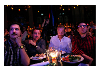
Audience members at "Never Sleep Alone," at Joe's Pub.